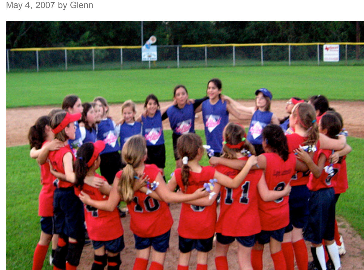
Swingin' Bats join Oak Hill Twisters for a friendly post-game cheer, May 3

On Thursday the Swingin' Bats played their first game at SALSA's Wright Field since their regular home field was soaked from two days of rain. The visiting Twisters appeared to be surprised when the South Austin girls held them scoreless in the first inning, but their bats woke up in the second and beyond, leading them to victory. Despite the score, our girls hit the ball well and made several spectacular fielding plays against the more experienced team from Oak Hill.